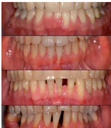
Fig 2: Miller's classification of gingival recession into four different classes. (11)

CLASS IV: Marginal tissue recession extends to or beyond the mucogingival junction with loss of interdental bone and causes mispositioning of the teeth. (10)